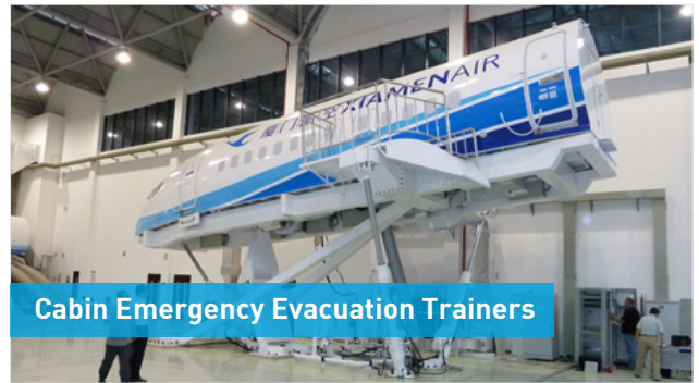
Cabin Emergency Evacuation Trainers

SEPTRE is our innovative, market-leading audio-visual system that offers a step change in how cabin crew are trained in Safety and Emergency Procedures. SEPTRE provides real-time graphics at each passenger window and highly realistic audio that covers all phases of flight and includes pre-programmed emergency scenarios, such as aborted take-off, engine fire, gear collapse, turbulence, ditching and decompression.