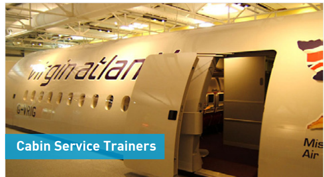
Cabin Service Trainers