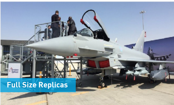
Full Size Replicas

Working under licence from Martin Baker, EDM supplies replica Ejection Seats for a variety of training environments. The seats can be manufactured to various levels of functionality and fidelity, ranging from full fidelity Maintenance Trainers to partially functional seats for simulators. Our G-Seats are designed to enhance standard flight simulator seats and contain numerous dynamic modules to give the pilot real-time motion cues.