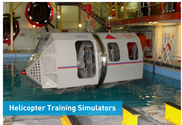
Helicopter Training Simulators

EDM can manufacture EGRESS Trainers and a variety of Helicopter Training Simulators including Helicopter Underwater Escape Trainers (HUETs) to teach personnel the correct escape procedures from an upturned helicopter submerged underwater.